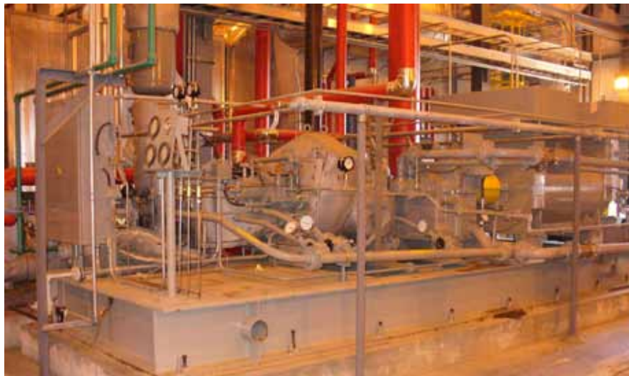
Steam let-down Turbines have been or will be installed in eight ICM-designed plants by the end of 2008.